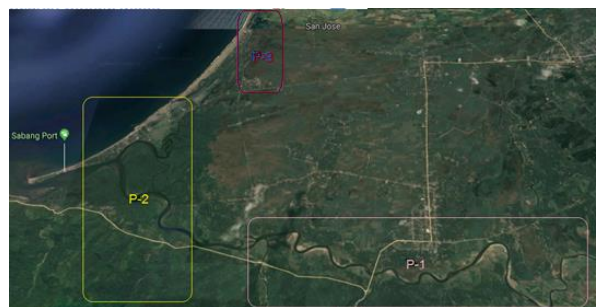
Fig. 3. Portions of Flood Affected Areas.

Flooding occurs if the amount of precipitation exceeds the evaporation rate and infiltration capacity of the soil [13] however it is caused by multiple factors like human causes by putting up building structures on water ways, inappropriate disposal of waste, soil compaction due to vehicular and human movements or hydro meteorological causes such as excessive rain fall, poor drainage system, high rate of soil water holding capacity [14]. The causes of flooding in P-1 is due to river bends of Lagonoy river (See Figure 3). Excessive amount of rainfall makes runoff water overflows to the floodplain areas. When the pressure gradient overcomes the centrifugal force in river bends, a stream is formed inside the section in transverse direction. Erosion of river walls which occurred in old rivers contributes a lot of damages in land around the river. The structures create false rivers right-of-way that consequently decreases the potential use of land [15]. Large amplitude and wavelength of river meandering resulted to large area of floodplain.