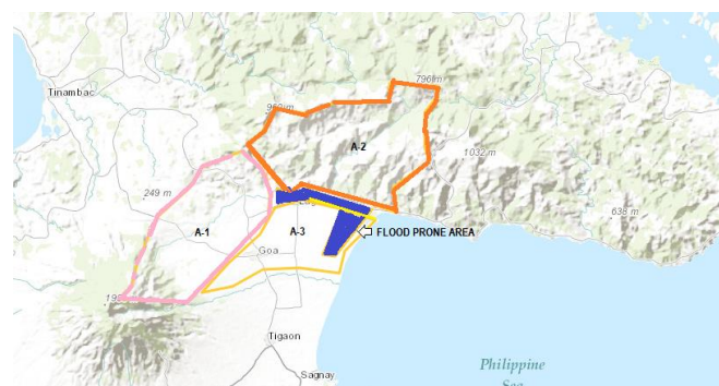
Fig. 1. The catchment and the flood prone areas.