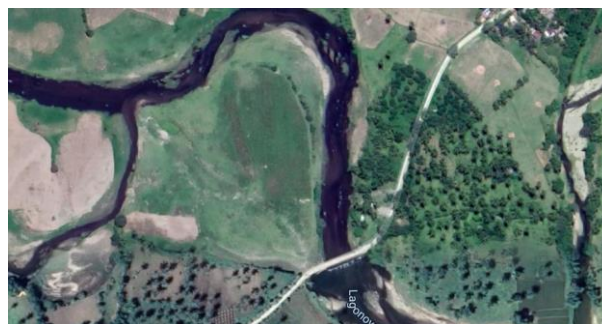
Fig. 4. River bends and the spillway.

Other causes of flooding is the constructed spillway which is located at coordinate 13.745549, 123.502383. The structure serves as road to connect two villages. The spillway is designed to safely convey floods to the watercourse downstream [16], but is inadequate to convey large volume of water flow.